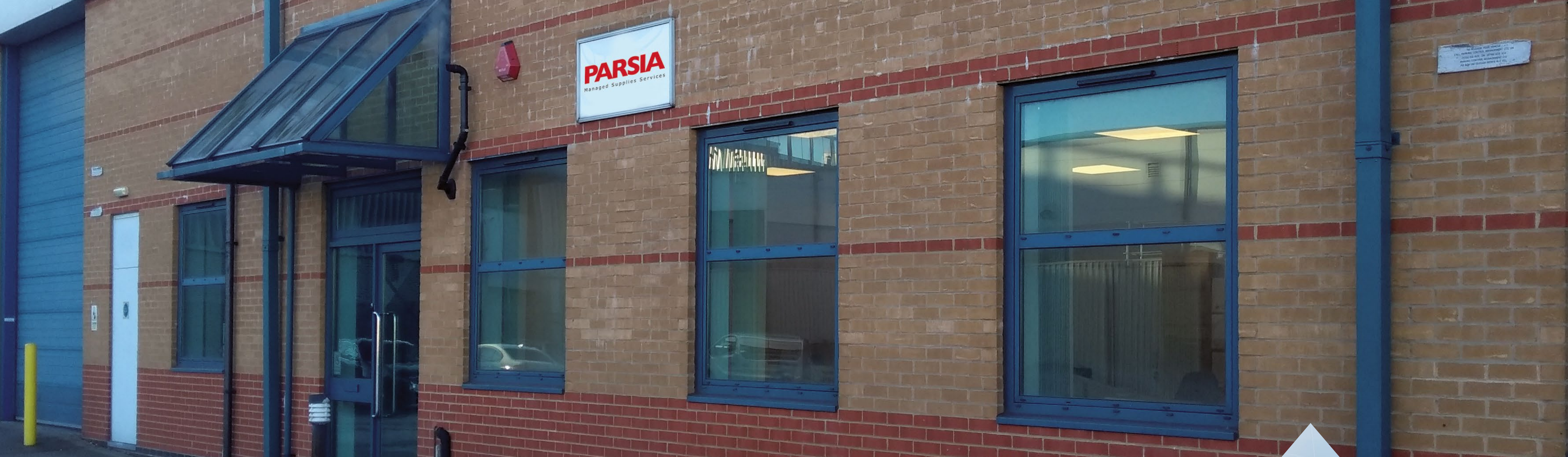
Parsia headquarters in London