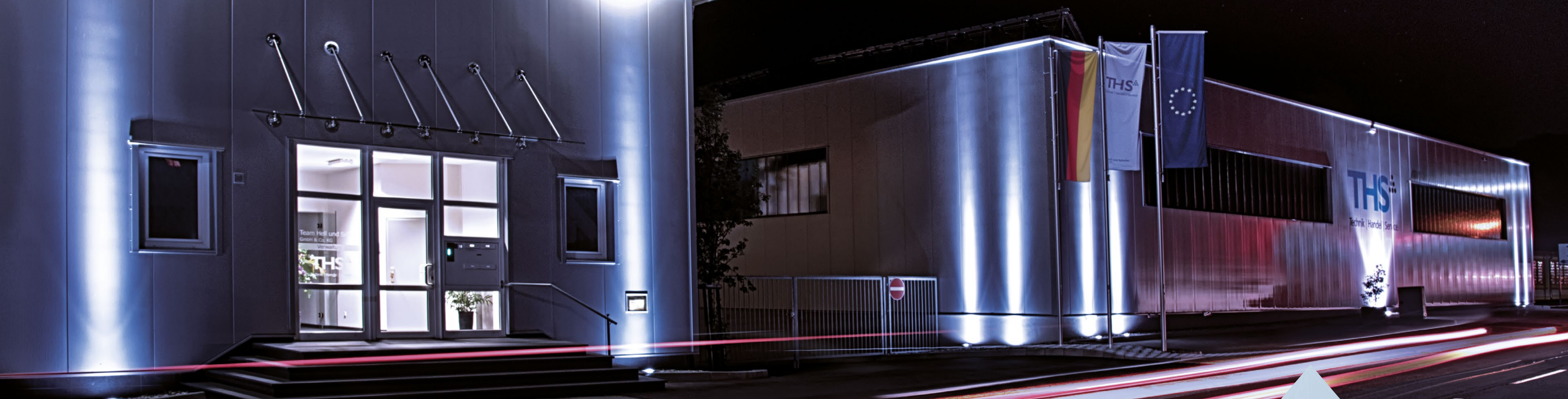
THS headquarters in Hemer-Ihmert